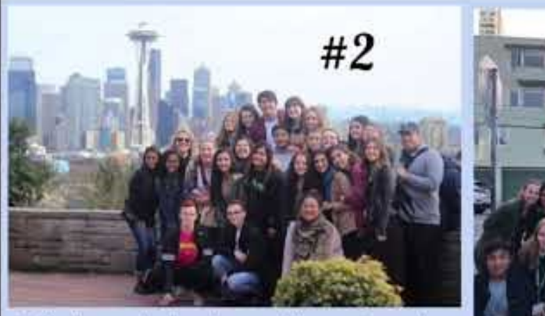
Both classes also travels around the country each year to national conventions. We have been everywhere from New York City to Seattle, Washington, D.C. to San Francisco.